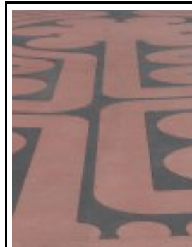
Our polymer concrete labyrinth at Our Lady of Victory Hospital in Stanley, Wisconsin, still beautiful two years after installation.