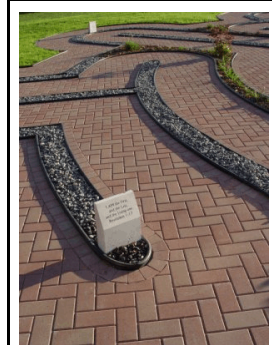
Scriptural monument in the "I AM" labyrinth installed in August at Valparaiso University in Indiana.