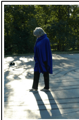
WA solitary walker at the dedication of the Global Harmony Labyrinth in Como Park, St. Paul, MN.

While you are on the website putting your labyrinth on the Locator list, why not go to the membership page and join the Labyrinth Society. They have categories for individuals, families, and organizations. Founded here in St. Louis in 1998, the Society offers a wide range of services and information. The annual gathering draws some 200 very interesting people. See the website for details.